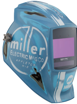
Vintage Roadster™ 281004