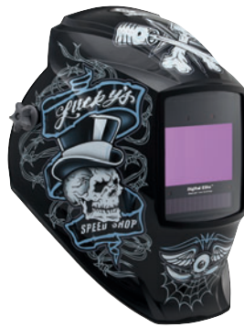
Lucky's Speed Shop™ 281001