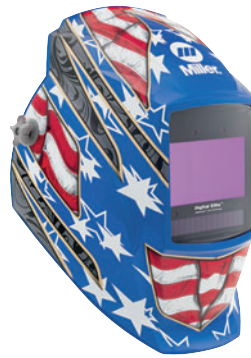
Stars and Stripes™ III 281002